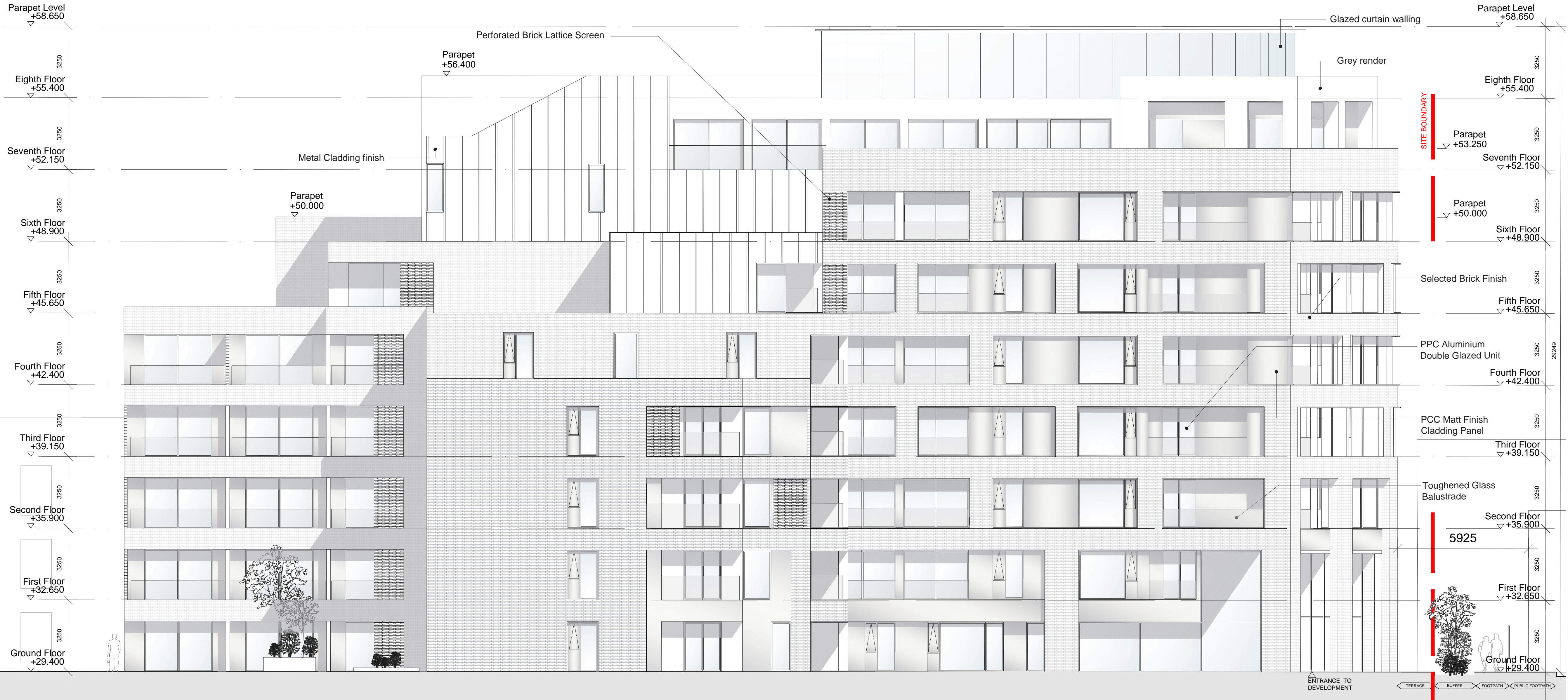
East Elevation - Scale 1:100@A1